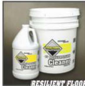
RESILIENT FLOOR Cleaner

Maintains like-new appearance without harming slip-resistance.