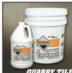
QUARRY TILE Treatment

Simple, do-it-yourself safety treatment and cleaner all in one.